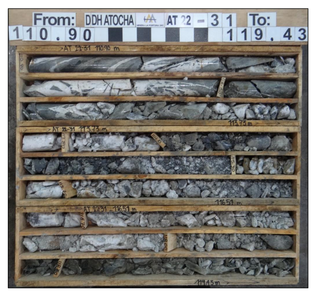
Photo 1. Wide (>7m) mineralized vein zone in hole AT-22-31 from 110.90 to 118.50m. Despite the impressive width of the interval, it was lacking the sulfide content and therefore precious metals values were also low.