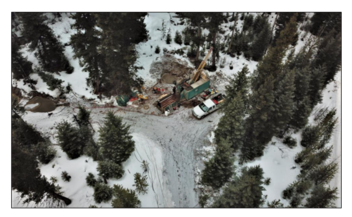
Figure 3: Drone airborne photo of drilling at the Gate/Prime Zone in Fall 2022

MPD is a large, 147 square kilometre land package located near several operating mines in the southern Quesnel Terrane, British Columbia's primary copper-gold producing belt. It is situated between the communities of Merritt and Princeton, with year-round accessibility and excellent infrastructure nearby. Following Kodiak's Gate Zone discovery in 2020, ongoing drill programs in 2021 and 2022 have significantly expanded the size and depth of known mineralization at the Gate Zone to one kilometre of strike length, 350 metres width and 900 metres depth. In addition, the Company has discovered a parallel porphyry trend at the nearby Prime Zone and will be expanding exploration efforts to new copper-gold target areas like Dillard, Man, and 1516 (Axe), plus new high grade gold-silver trends like the Beyer discovery.