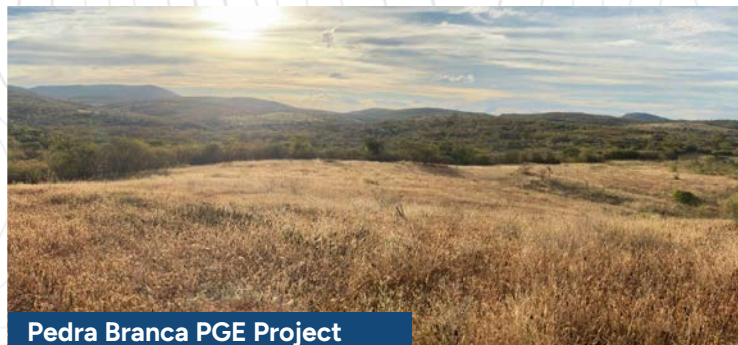
Pedra Branca PGE Project