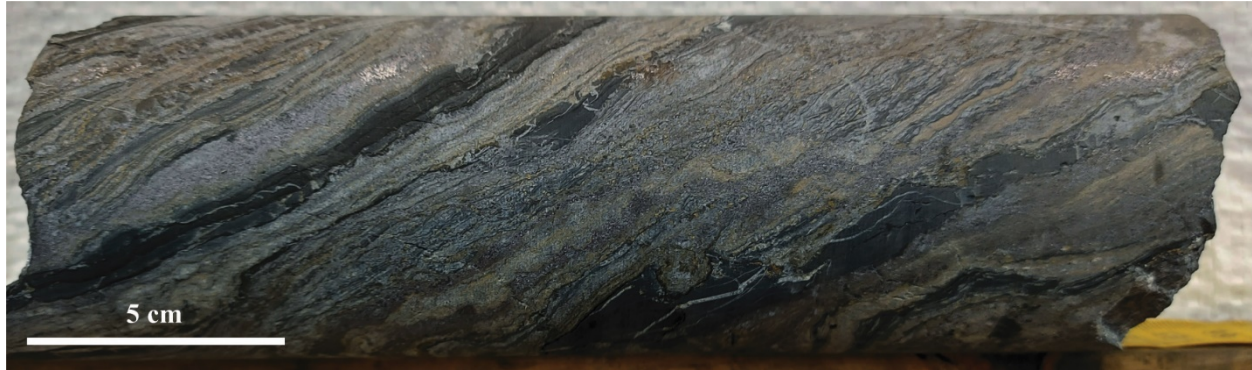
Photo 1: Hole TS21-001 at 148.53-148.73 m illustrating laminated high-grade mineralization.

Indicated Resource in addition to 1.68 Mt at 9.86% zinc, 12.86% lead and 170.0 g/t silver Inferred Resource (see Fireweed news releases dated January 10 th , 2018, and reports filed on www.sedar.com for details). The Tom East Zone is hosted within and around the hinge of a tight north-plunging syncline fold containing stratiform laminated sphalerite, galena, and barite mineralization. The mineralization is hosted by late-Devonian diamictite and carbonaceous mudstones in the Portrait Lake Formation (Earn Group).